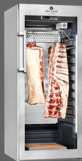
DX 1000 PREMIUM S FOR UP TO 100kg