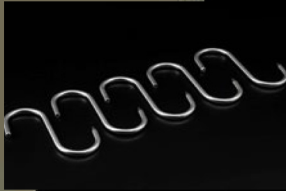
SWIVEL HOOK STAINLESS STEEL HOLDS UP TO 100kg (180 x 8 mm)