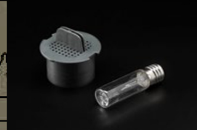
UVC REPLACEMENT BULB ACTIVE CARBON FILTER CARTRIDGE