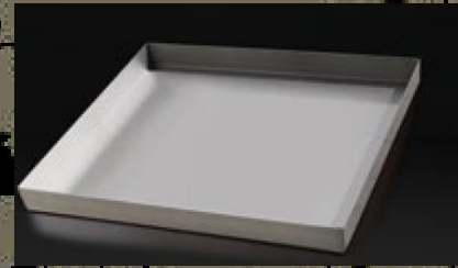
SALTAIR TRAY STAINLESS STEEL FOR THE BOTTOM (for max 4 block slat blocks)