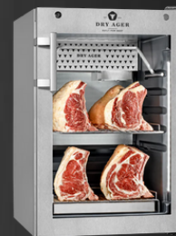
DX 500 PREMIUM S FOR UP TO 20kg