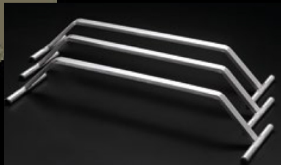
STAINLESS STEEL HANGER for up to 80kg