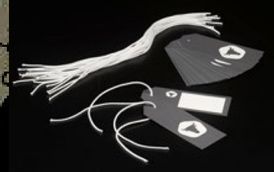
LABELS FOR THE MEAT (set of 20 including a nylon tie)