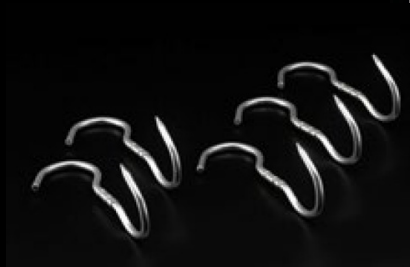
S-HOOK STAINLESS STEEL HOLDS UP TO 100kg (160 x 8 mm)