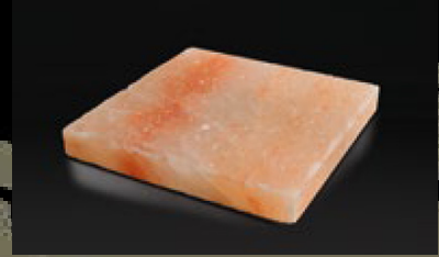
SALTAIR HIMALAYAN SALT BLOCK (for a more intensive flavour)